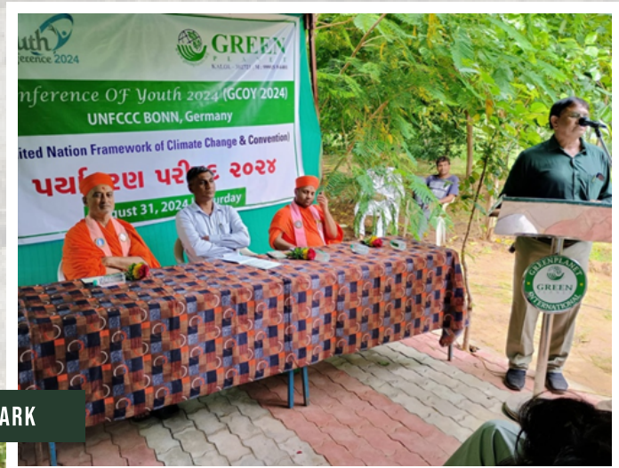
📍 FOREST PARK

There are many ways to contribute to the NGO's work. Whether it is through a single or monthly financial assistance, approvals, gift of land, resources or even through volunteer programs, we invite you to become a force for nature today and help leave a nature today and help leave a natural legacy for tomorrow.